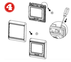
Install the housing cover and lock the external frame

Thermostat must be installed by a fully qualified electrician and all wiring must meet most recent wiring regulations.